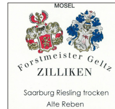
Zilliken Saarburg Riesling Trocken Alte Reben 2024

Offers an attractive fresh and herbal nose of greengage, pear, cinnamon, yellow peach, spicy, white pepper, and smoke. The wine nicely juicy and creamy on the palate, with good grip and intensity. The finish is fresh, as zesty elements come through, and leaves and almost dryish feel. This more serious version of Butterfly superbly combines intensity and lightness and is a real pleasure to drink. July 2025