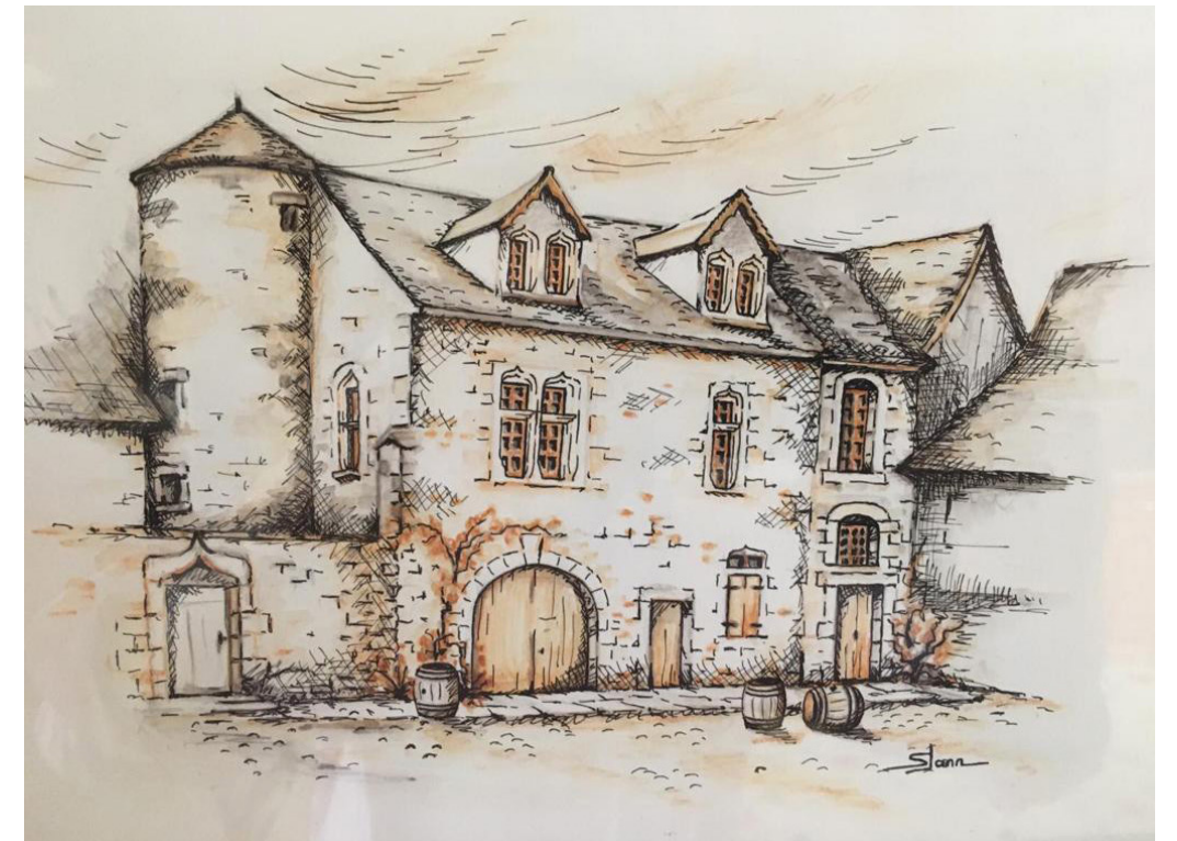
Vieux Château de Puligny-Montrachet