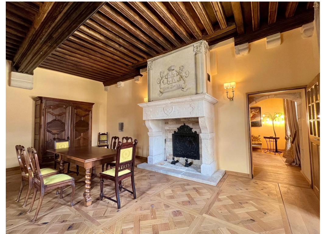
Vieux Château – Renovated Great Room