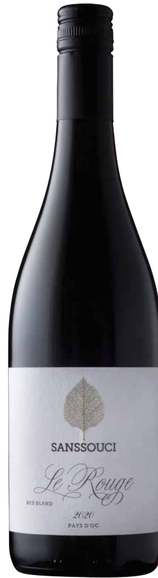
SYRAH & GRENACHE