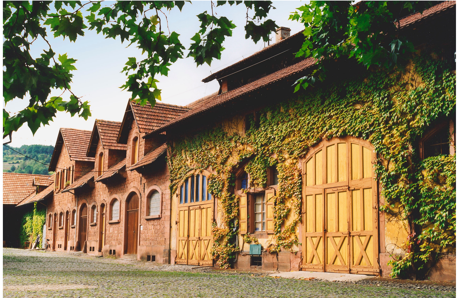
VILLA WOLF – PFALZ