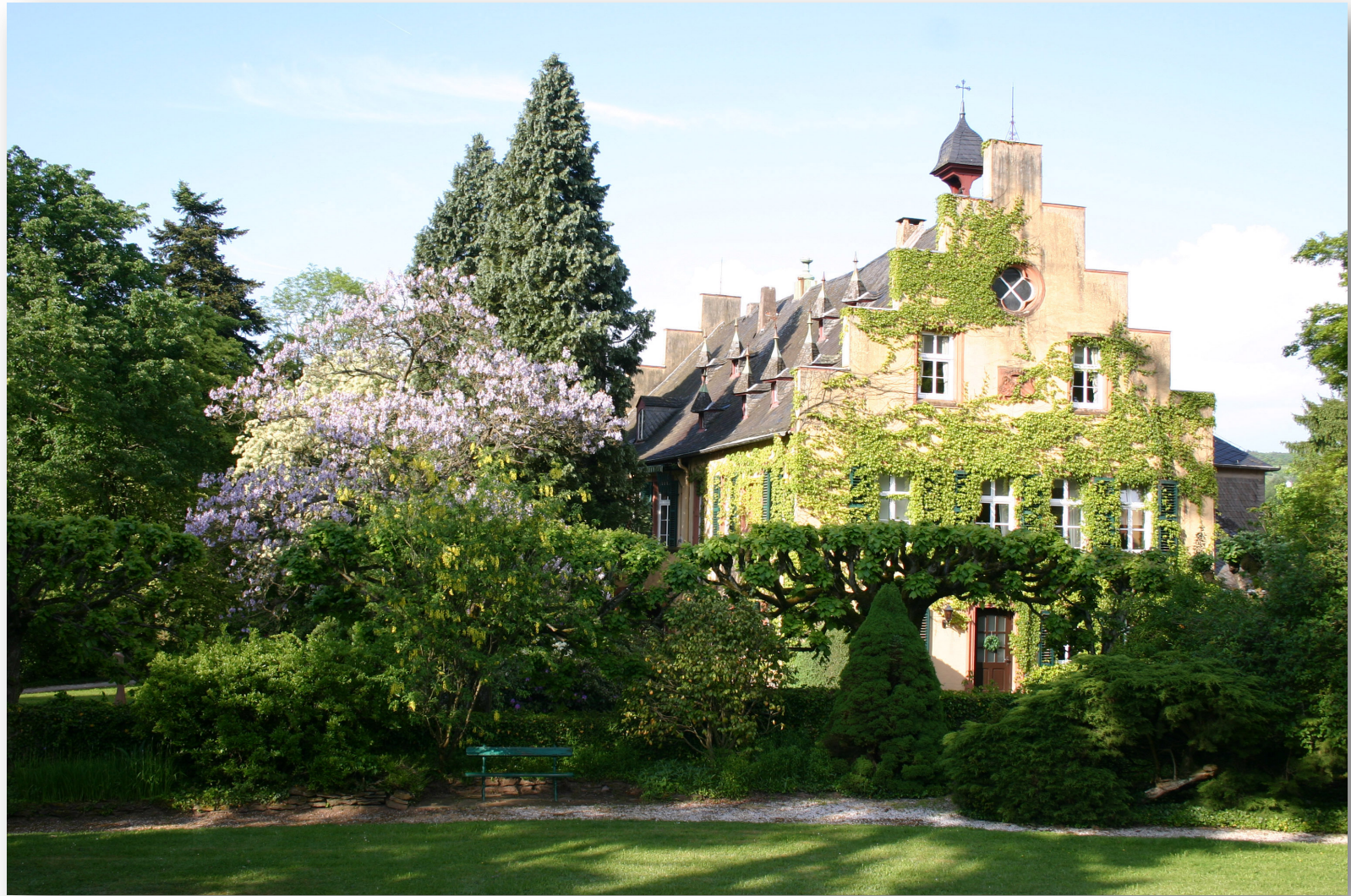
MAXIMIN GRÜNHAUS – RUWER