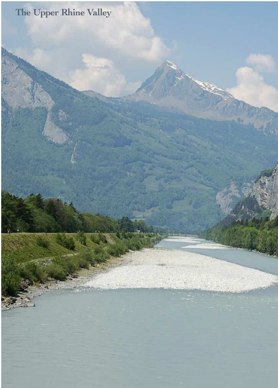
The Upper Rhine Valley