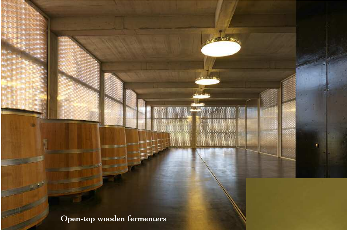
Open-top wooden fermenters