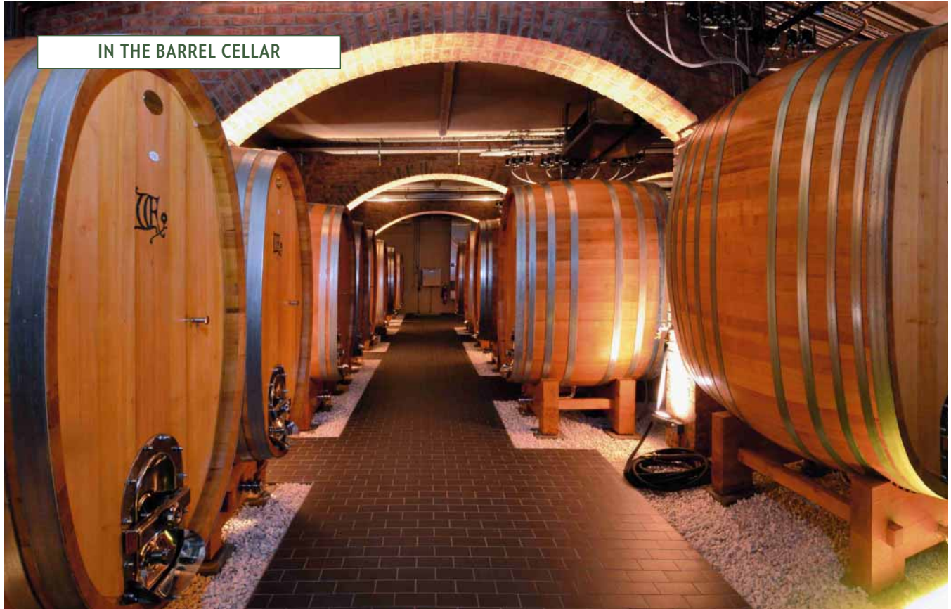
IN THE BARREL CELLAR