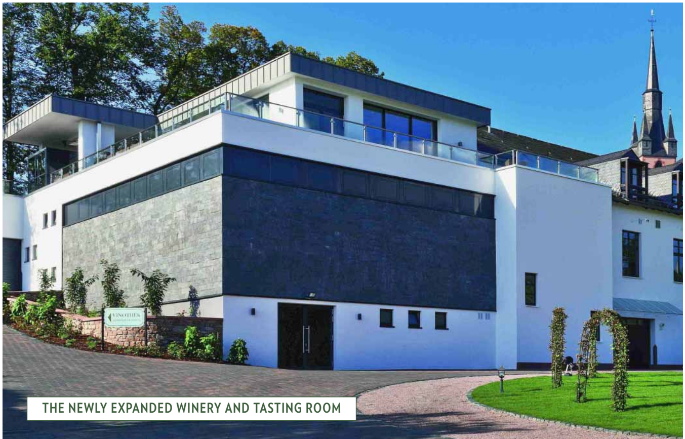
THE NEWLY EXPANDED WINERY AND TASTING ROOM