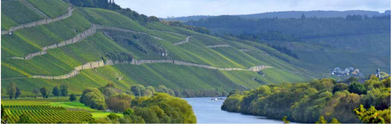
The precipitous, slate-soil vineyards of the Brauneberg slope, in Germany's Middle Mosel valley.