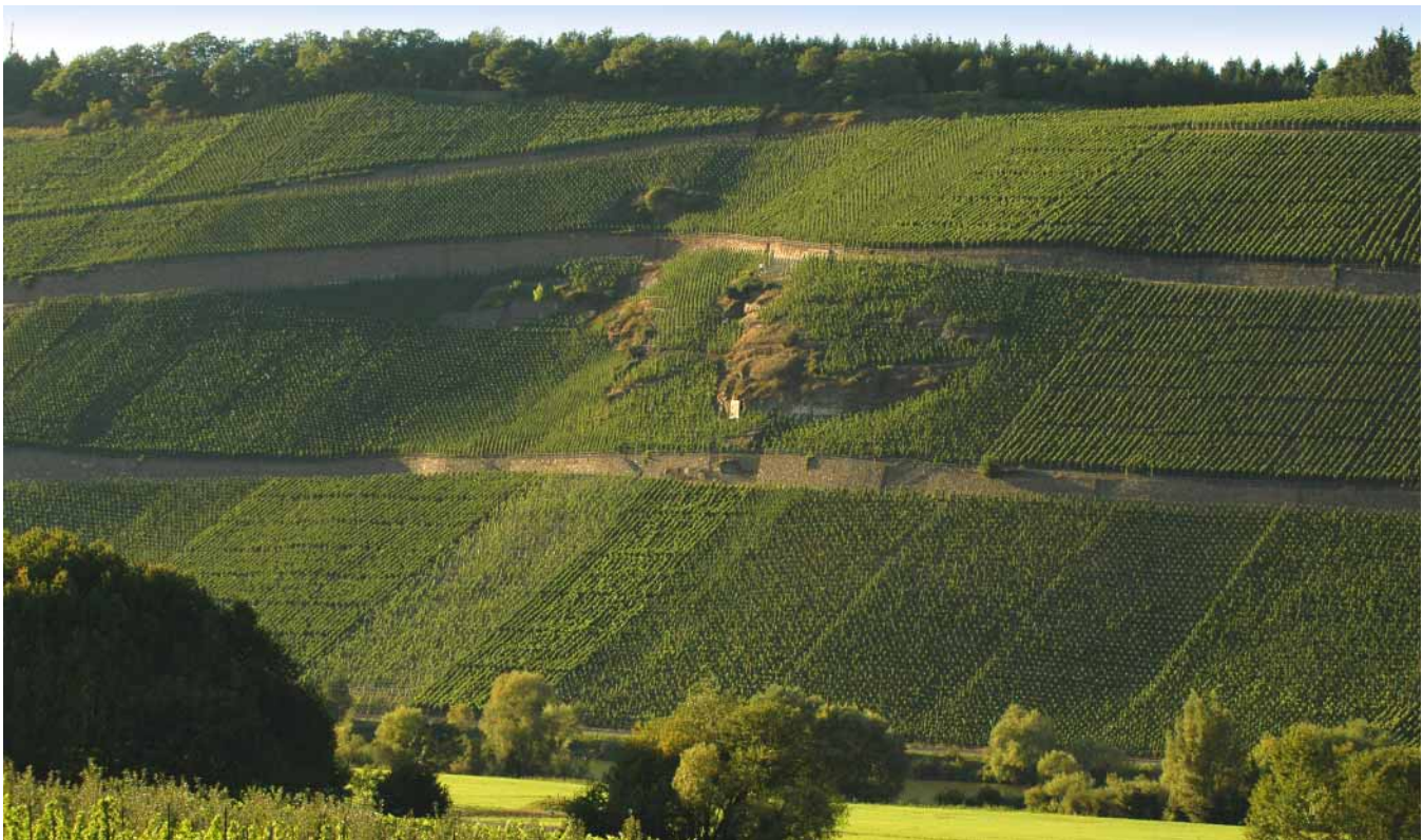
The Juffer and Juffer Sonnenuhr vineyards, as viewed from across the river in the village of Brauneberg. The Sonnenuhr (sundial) is at the center.