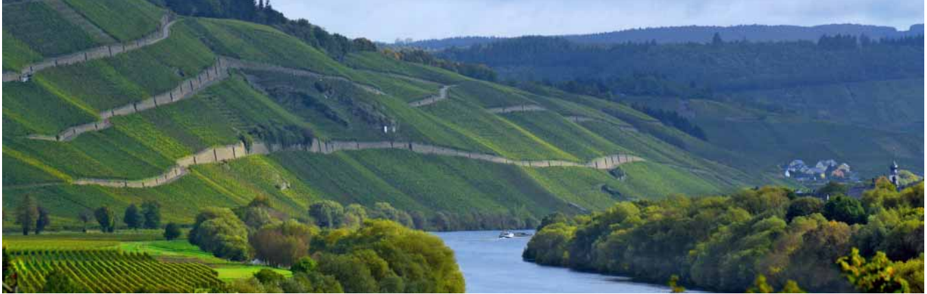
The precipitous, slate-soil vineyards of the Brauneberg slope, in Germany's Middle Mosel valley.