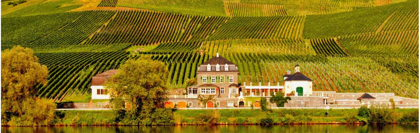
The Dr. Loosen estate house and vinothek, on the right bank of the Mosel River, just downstream from the historic wine village of Bernkastel.