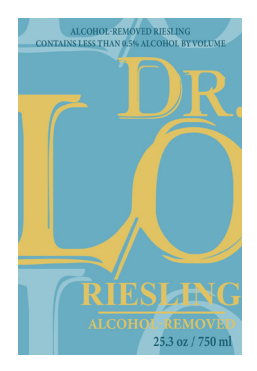
Dr. Lo Riesling NV

[91] International Wine & Spirits Competition